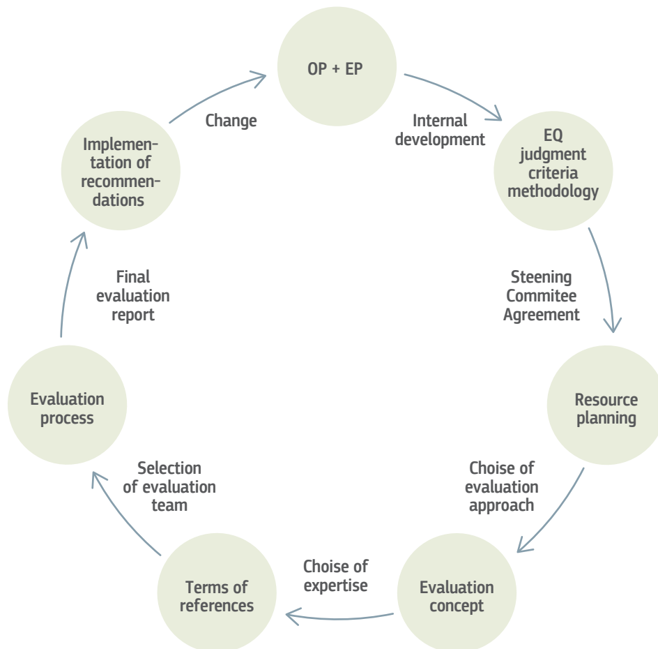
Figure 2: Evaluation life cycle

The evaluation life cycle (Figure 2) covers the whole programme period, starting with the preparation of the OP, including the first EP and the ex-ante evaluation.