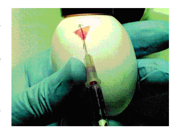
Inoculation. Image from CLAVIJO A et al 2000

After inoculating each egg, the 'window' is closed with liquid paraffin employing a spatula or a cotton swab.